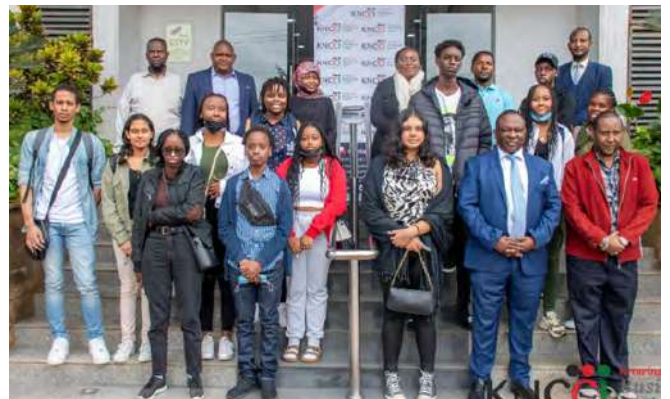
Students from the Mombasa Academy during a career visit to KNCCI