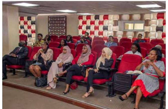
KNCCI members during a financial literacy training at the DTB Centre