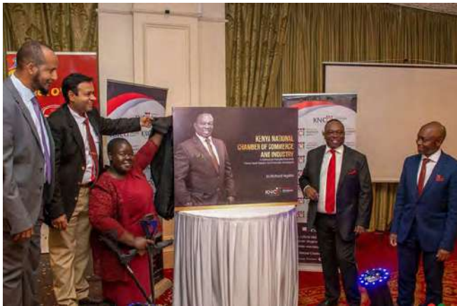
Chamber President together with KNCCI directors during the launch of his three-year report at KNCCI