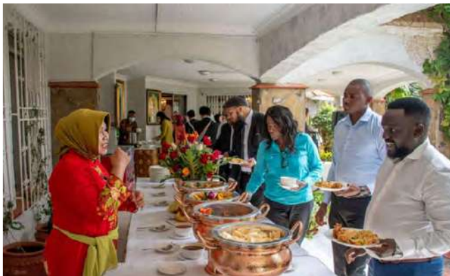
The Embassy of Indonesia in Kenya hosted a business luncheon for KNCCI members interested in frozen foods to trade with an Indonesian company Unirama at the Indonesian Ambassador's Residence.