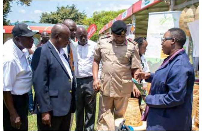
Exhibitors and participants during the Lake Region Private Sector Forum at the Busia Youth Polytechnic Grounds.