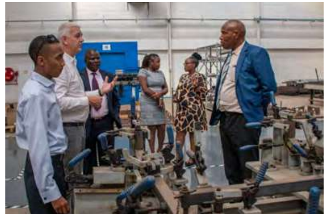
KNCCI Management during an industrial visit at Mobius Motors Showroom