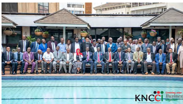
Guests and NGC members during a meeting at the Hilton Hotel Nairobi